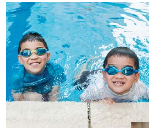
Newton Recreation Centre · 8 Min Walk