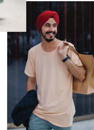
Dollarama · 4 Min Walk