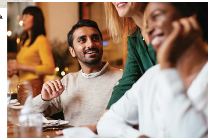
Boston Pizza · 5 Min Walk