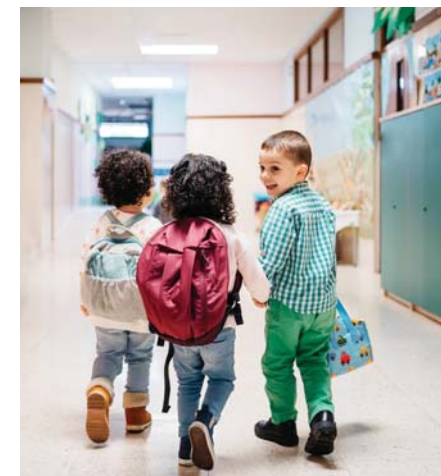
Frank Hurt Secondary · 6 Min Walk