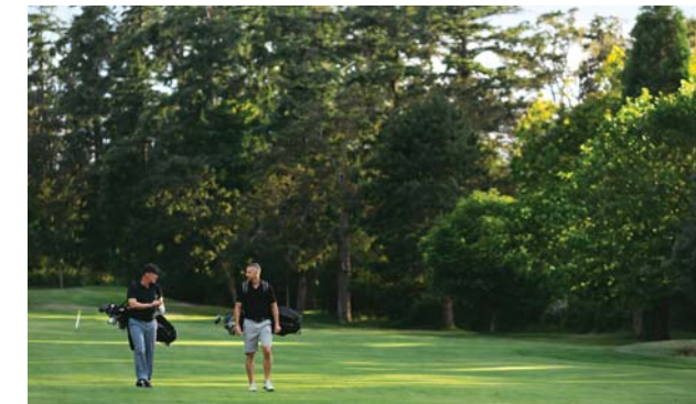
Guildford Golf & Country Club · 5 Min Drive