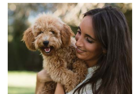
Community Park · 1 Min Walk