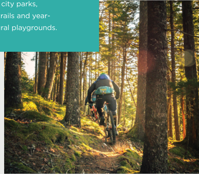
North Shore Spirit bike trail