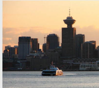
SeaBus access to downtown

Walking distance to Lonsdale Quay Market, the SeaBus and Waterfront Entertainment District, Terza is also steps away from city parks, mountain trails and year-round natural playgrounds.