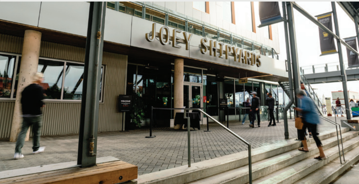
The Shipyards District