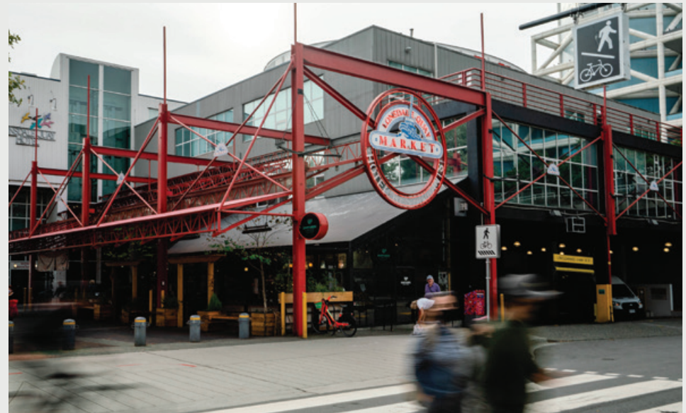
Lonsdale Quay Market